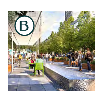
UPTOWN COMMONS PARK: 1 ACRE